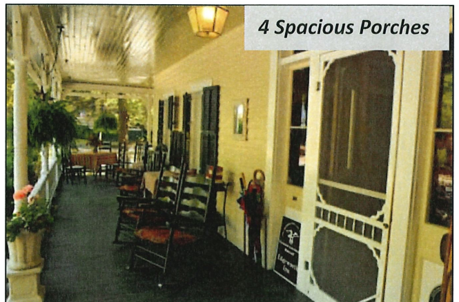
4 Spacious Porches