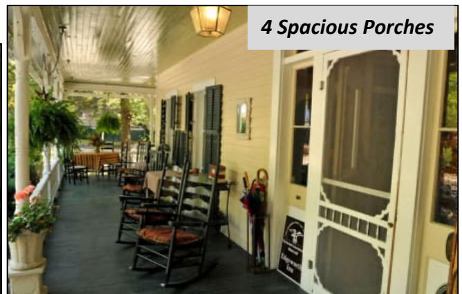
4 Spacious Porches

Edgeworth Inn is a historic Queen Anne Carpenter structure that has operated continuously as a Bed & Breakfast since the 1970's. This 12 bedroom, 10 bathroom cottage includes two suites. There are 10,535 square feet under roof, with 6300 t 8300 square feet being heated depending on the season. Excellent rental history as a Bed & Breakfast.