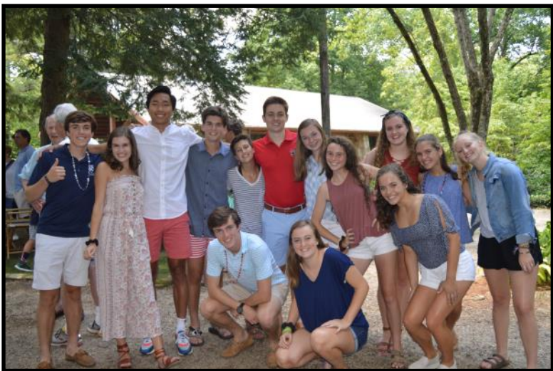
The Youth Staff works very hard to ensure the youth programming is fun, engaging, and safe. Thank them next time you see one of them!