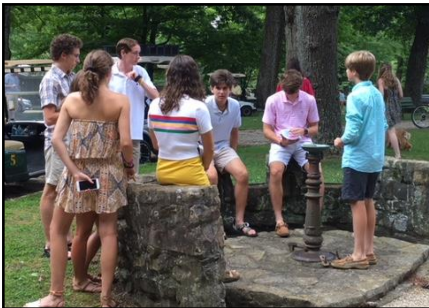
Youth preparing for Sunday Service.