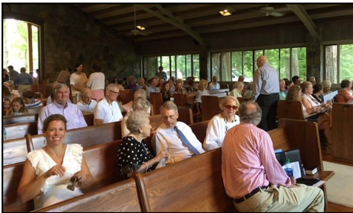
As families arrived for the 4th, the Chapel started filling up early in the week!