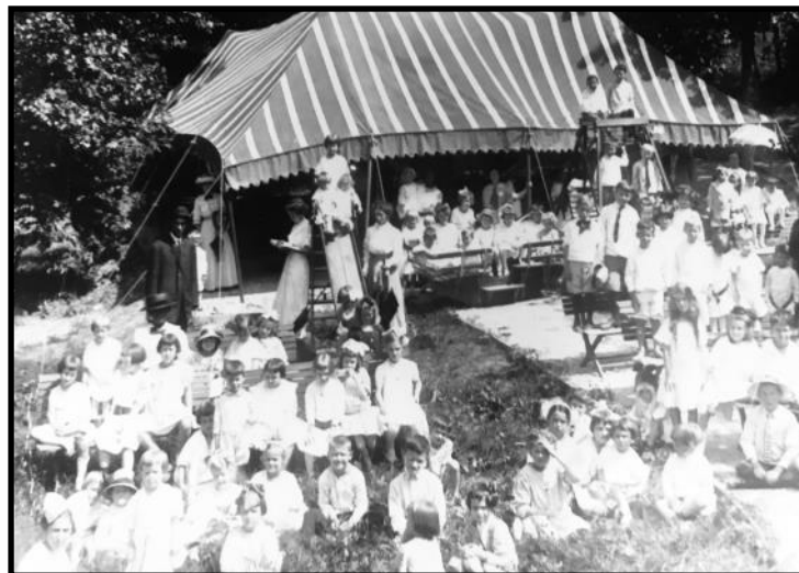
Above, the first children's playground. Left, the original posts still there today!