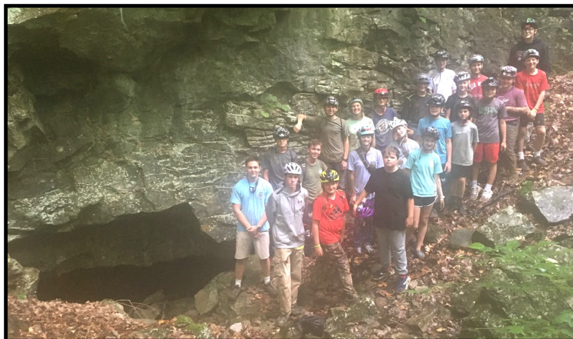
Let's go caving! Youth prepare to explore this cave on an excursion last week.