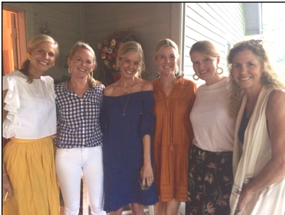
Left, these beautiful women attended the pickleball tournament kickoff party last week.