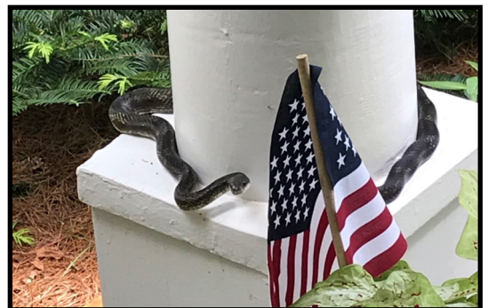
Right, an uninvited visitor says hello.