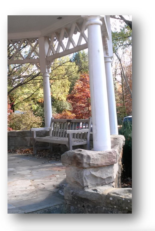
Come Sit Awhile and Relax