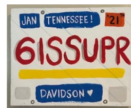
The date at the top=January 21, when they bought the house. At the bottom= they live in Nashville/Davidson County. 6= They have 6 kids