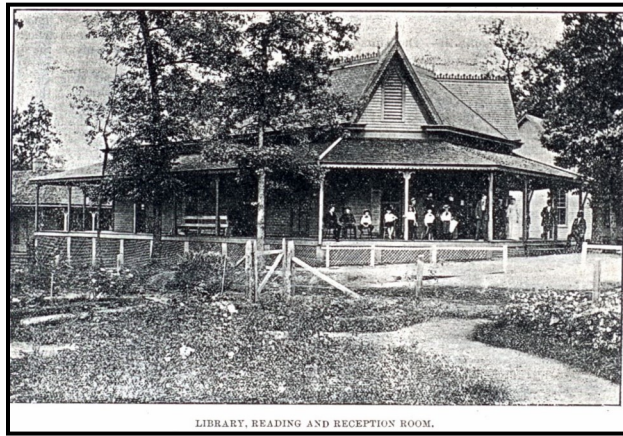
LIBRARY, READING AND RECEPTION ROOM.

“More and more people kept coming to the mountain and they needed more space to put them. So the Assembly Inn was put up and ready to use by the summer of 1895. It was built where the old restaurant used to stand. The inn was designed by R. H. Hunt, a Chattanooga architect. It’s right interesting how we got enough lumber to construct it.