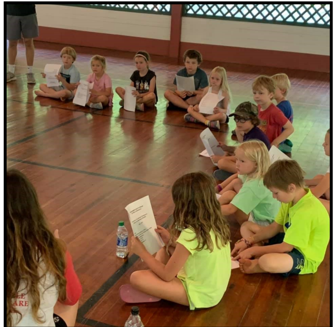
Above: Eaglets rehearsing in the Gym for their performance last week in A Midsummer Night's Dream