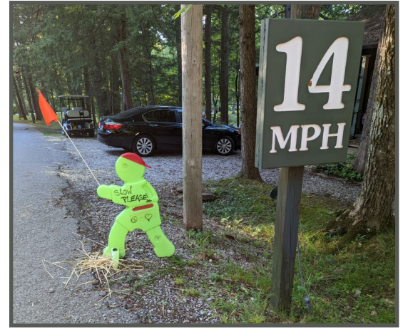
Slow pokes welcome ... speed demons shamed. Keep it under 14 out there, folks.

Sunday: Footloose (1984, PG) Wednesday early-bird: A Bug's Life (1998, G) Wednesday: Willy Wonka & The Chocolate Factory (1971, PG) Thursday: Despicable Me (2010, PG)