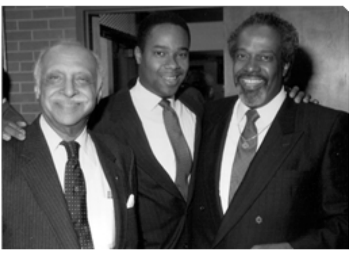
Three generations of H. Beecher Hicks men: Grandfather (left), III (center), and father (right).

With thanks to the Economic Club of Nashville for material used in this profile.