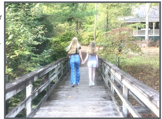
Below: Ten years later