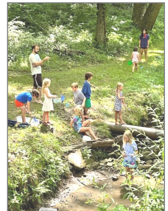
These Eaglets were intent on catching critters after a good rain.