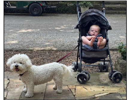
This doggo is in compliance—leashed and under supervision—though we assume an adult was available for extra supervision and clean-up duty.

* Longtime Mountain Voices readers know that if you send platform@mssa1882.org a picture with a dog, it'll probably get printed in a future newsletter.